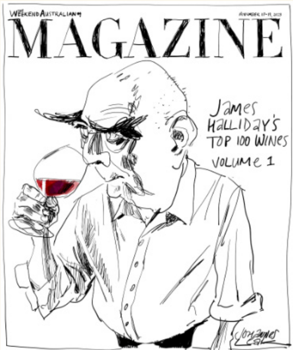
James Halliday's Top 100 Wines of 2023 The Weekend Australian Magazine

“ Grenache's reach grows from Victoria to Western Australia. A wine of utmost clarity and purity, its perfumed red flower and violet bouquet extremely good, the precision and clarity of the juicy red berries/cherries even better, mouth-watering and lingering, but never sweet. 97 Points ”