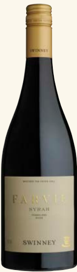
2018 Farvie Frankland River Syrah - 98/100

Syrah of the Year awarded to the 2021 Farvie Frankland River Syrah, The Game Changer award presented to the 2021 Farvie Frankland River Mourvèdre. 2021 Farvie Syrah, 98/100. 2021 Farvie Mourvèdre, 98/100