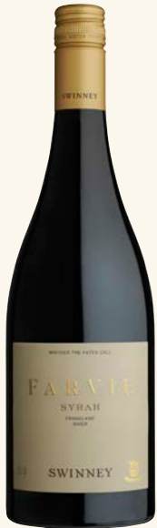
2018 Farvie Frankland River Syrah 17+/20 Points

"The fruit, the whole fruit and almost nothing but the fruit. A really gorgeous wine that's not like any other Grenache or Garnacha I have come across – presumably a terroir expression" - Jancis Robinson