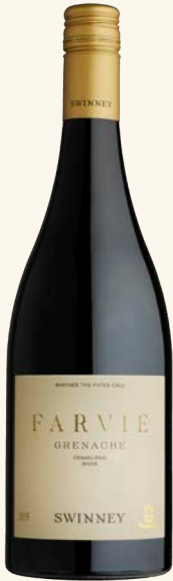
2019 Farvie Frankland River Grenache 17.5/20 Points