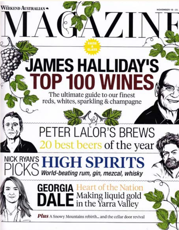
James Halliday's Top 100 Wines of 2022 The Weekend Australian Magazine