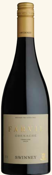
2018 Farvie Frankland River Grenache 18/20 Points