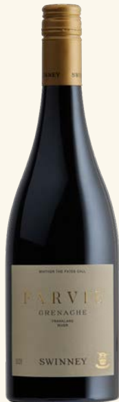
2020 Farvie Frankland River Grenache 17.5/20 Points