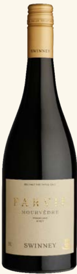
2021 Farvie Frankland River Mourvèdre - 98/100